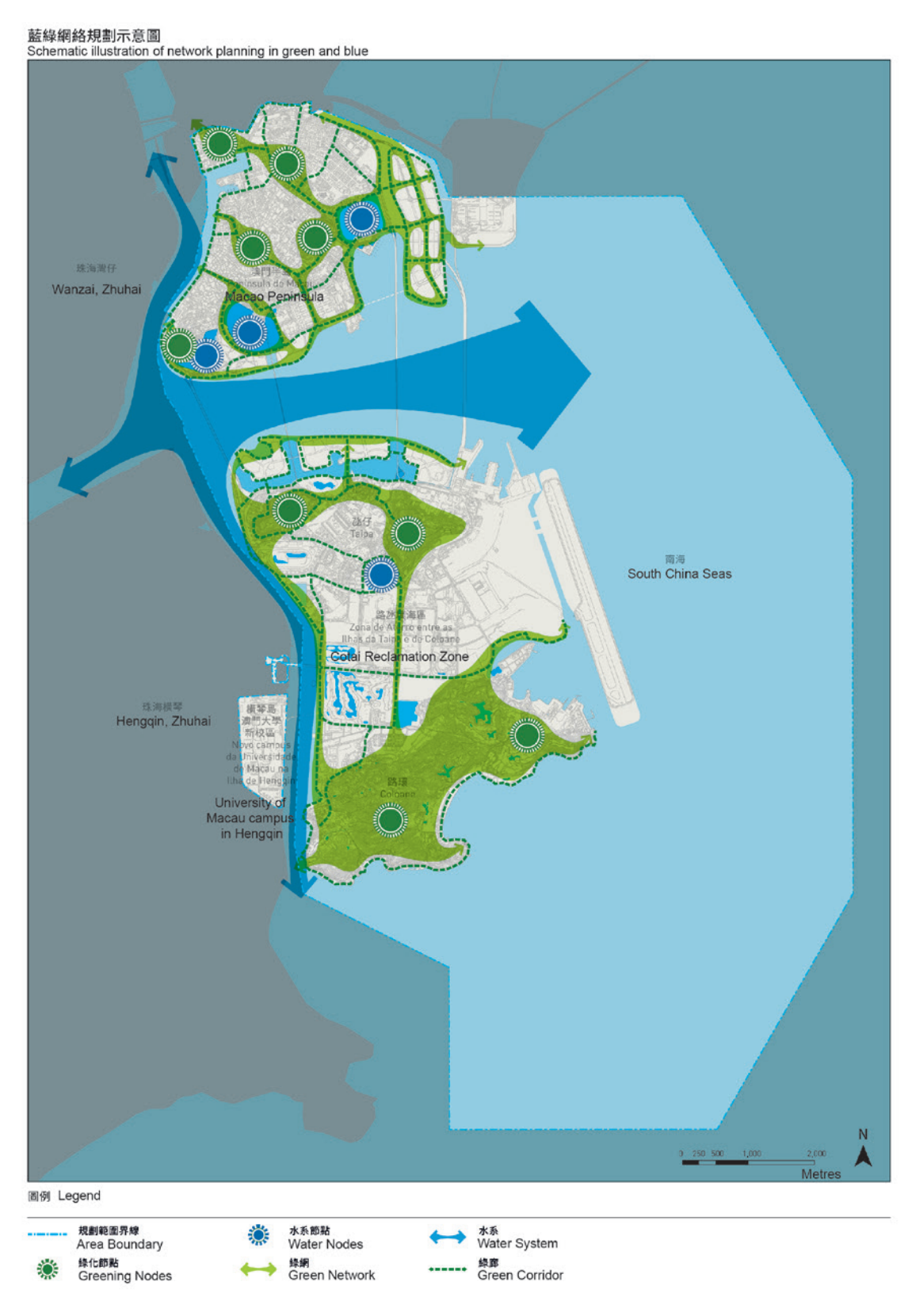
Figure 2: Schematic Illustration of the Layout of Urban Greenery and Environmental Projects